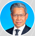
Dato' Sri Mustapa Mohamed Malaysian Minister of International Trade & Industry